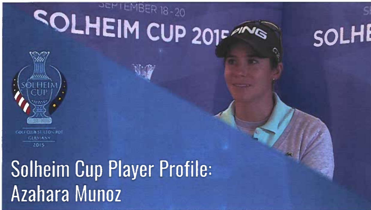
Solheim Cup Player Profile: Azahara Munoz