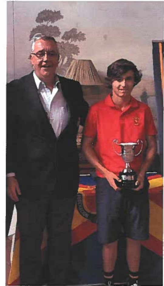
Sub-18 Internacional Sherry Golf, Septiembre