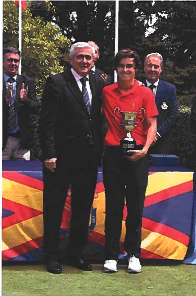
Absoluto de España A Coruña, Julio