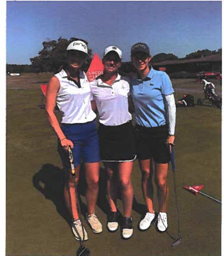
3 alumni in the Ladies European Tour in 2020