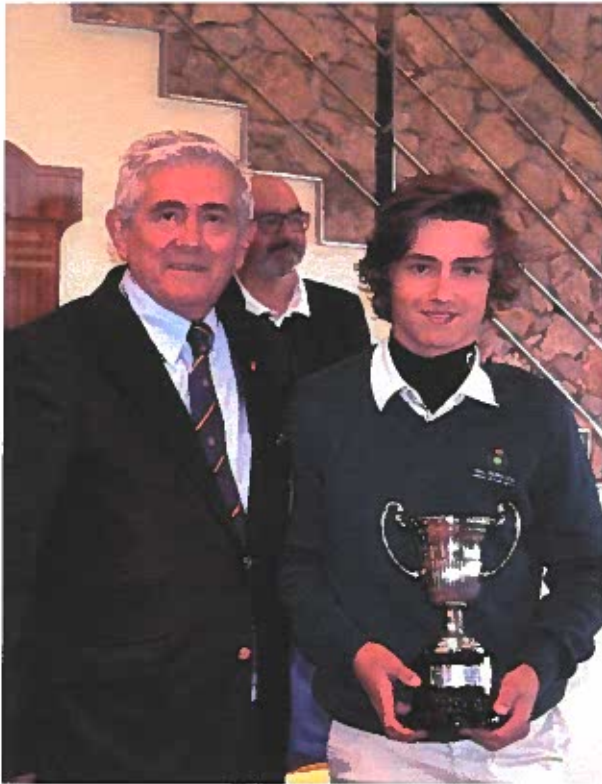
Sub-18 de España Las Pinillas, Marzo